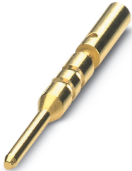
Crimp contact, turned, contact diameter: 0.8 mm, crimp range: 0.08 mm² ... 0.25 mm²

Please be informed that the data shown in this PDF Document is generated from our Online Catalog. Please find the complete data in the user's documentation. Our General Terms of Use for Downloads are valid ( http://phoenixcontact.com/download )